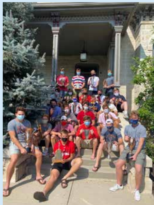
New members do their obligatory trophy cleaning before classes commence in the fall.